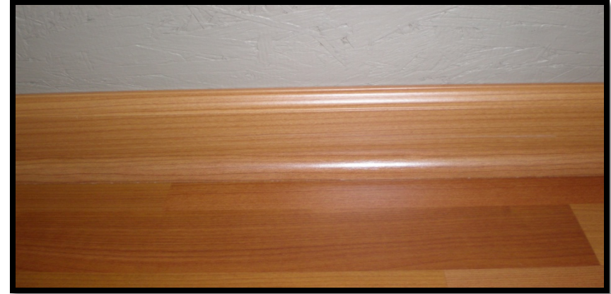
MATCHING WALLBASE AND QUARTERROUND