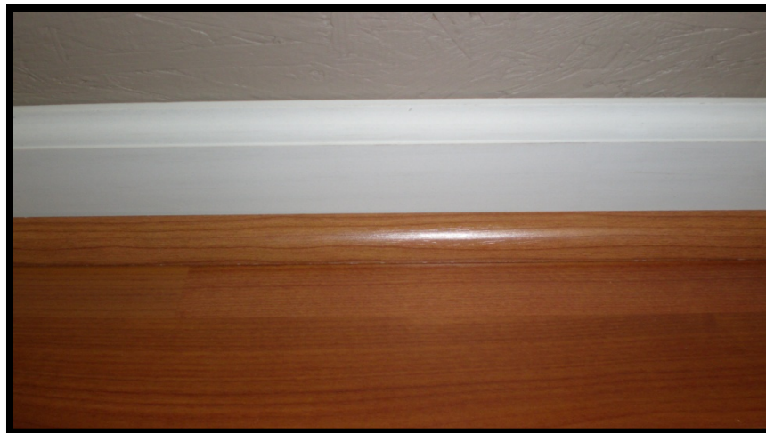
PRIMED WALLBASE AND MATCHING QUARTERROUND