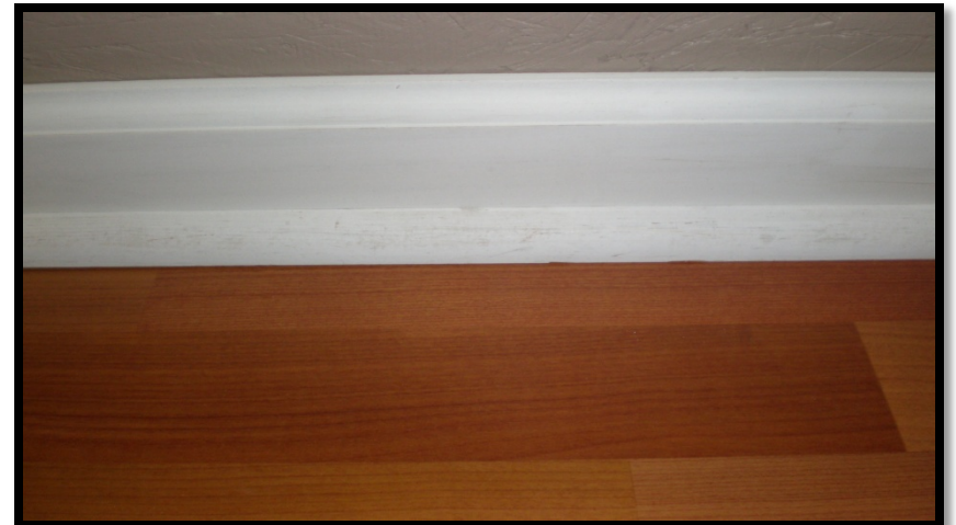
PRIMED WALLBASE AND QUARTERROUND